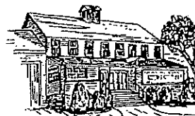
THE DEPOT LANE THEATRE